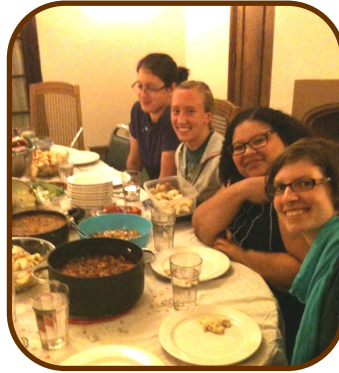
Ready for a potluck!

ILYM is a spiritual community of Quakers, also known as the Religious Society of Friends. Though the individuals in this community attend some 21 affiliated local Meetings across four states.