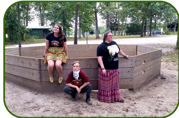
At DuBois Center during Blue River Quarterly